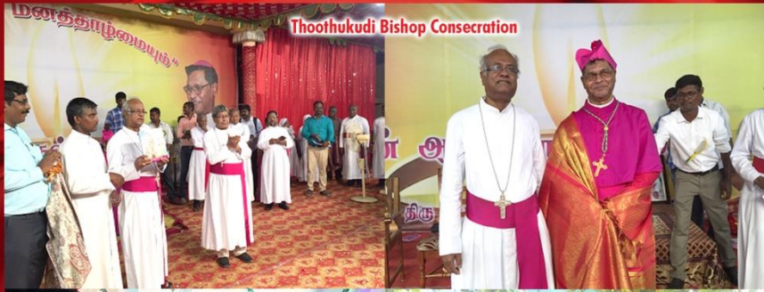
Thoothukudi Bishop Consecration

நமக்காக பாடுபட்டார்! நமக்காக மரித்தார்! நமக்காக உயிர்த்தார்!