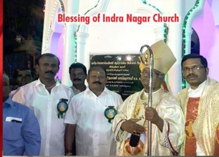
Blessing of Indra Nagar Church