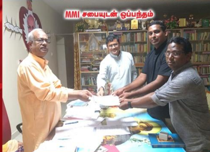
MMI சபையுடன் ஒப்பந்தம்