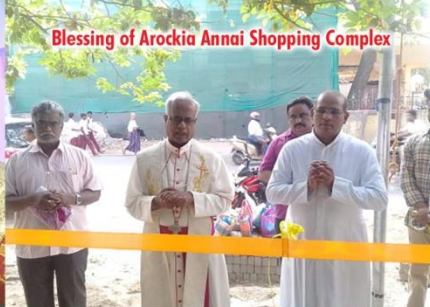
Blessing of Arockia Annai Shopping Complex