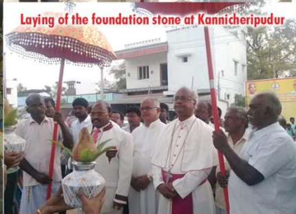
Laying of the foundation stone at Kannicheripudur