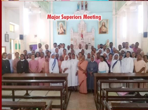
Major Superiors Meeting