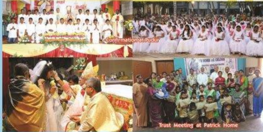
Confirmation at Padur