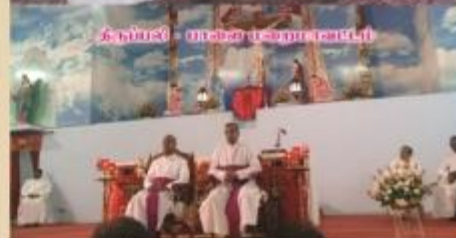
மதுரை மறைமாவட்ட வேது பேராயர்