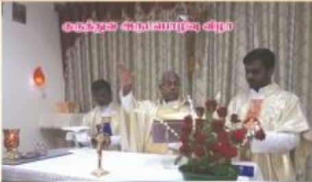
கடைத்தல் செய்து வழிபாடு

“புதியதோர் உலகம் செய்வோம் - கெட்ட போரிடும் உலகத்தை வேரோடு சுரப்போம்” - பாரதிதாசன்