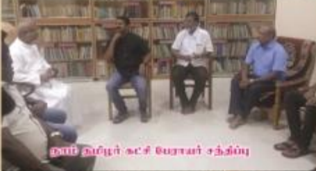
மதுரை மறைமாவட்ட வேது பேராயர் உயர் உயர்