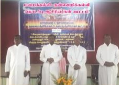
புனைக்கக்கூடாது - நமது உயர் உயர் உயர் உயர் - மதுரை மறைமாவட்ட வேது பேராயரின்