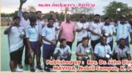
மதுரை மறைமாவட்ட வேது பேராயர்