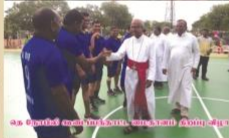
அதே நேரத்தில் கடைத்தல் செய்து, மதுரை மறைமாவட்ட வேது பேராயர்