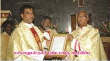
மதுரை மறைமாவட்ட வேது பேராயர் உயர் உயர்