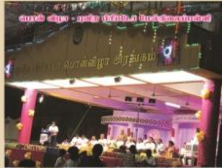
உயர் உயர் - மதுரை மறைமாவட்ட வேது பேராயரின்