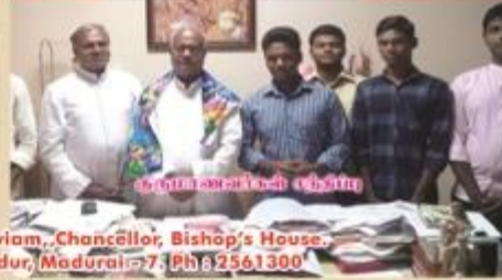
மதுரை மறைமாவட்ட வேது பேராயர்