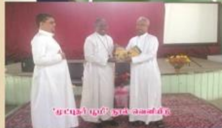
மதுரை மறைமாவட்ட வேது பேராயர்