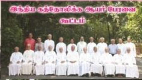
இந்திய கத்தோலிக்க ஆயர் பேரவை கூட்டம்