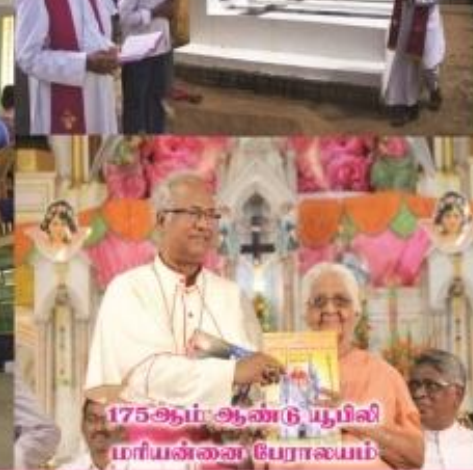
175ஆம் ஆண்டு பூரிலி மரியன்னை பேராலயம்