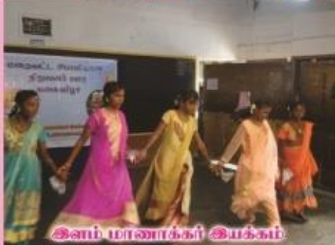
இளம் மானாக்கர் இயக்கம்