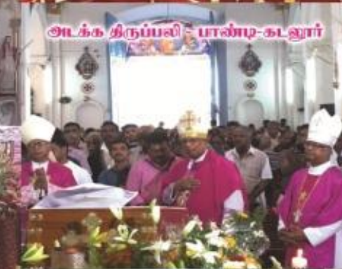
அடக்க திருப்பலி - பாண்டி-கடலூர்