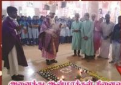
அனைத்து ஆன்மாக்கள் நனைவு