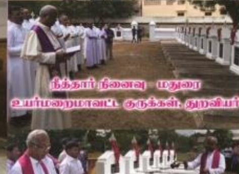
நீத்தார் நனைவு மதுரை உயர்மறைமாவட்ட குருக்கள், துறவியர்