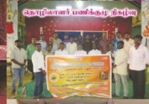
தொழிலாளர் பணிக்குழு நிகழ்வு