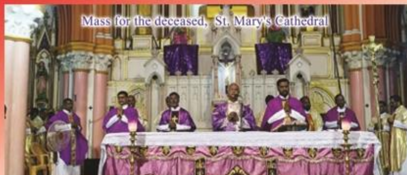
Mass for the deceased, St. Mary's Cathedral