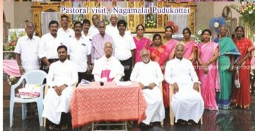
Pastoral visit, Nagamalai Pudukottai