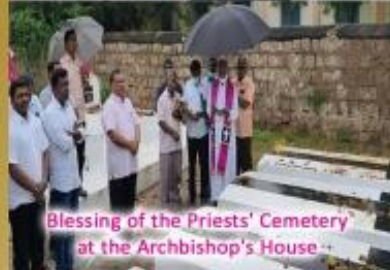
Blessing of the Priests' Cemetery at the Archbishop's House