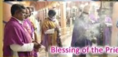
Blessing of the Priests Cemetery at Cathedral