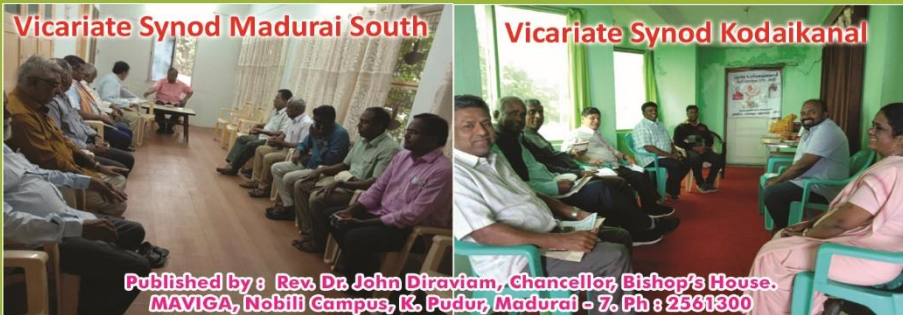
Vicariate Synod Madurai South