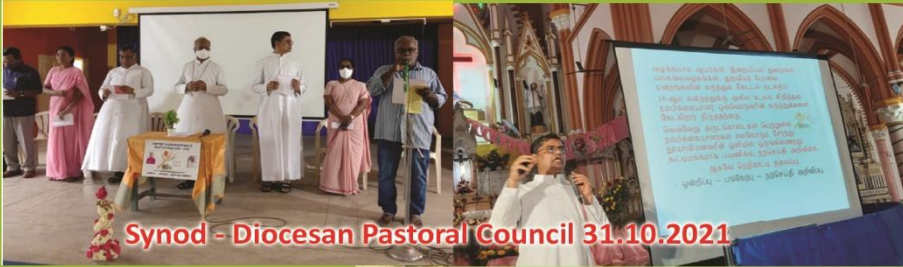
Synod - Diocesan Pastoral Council 31.10.2021