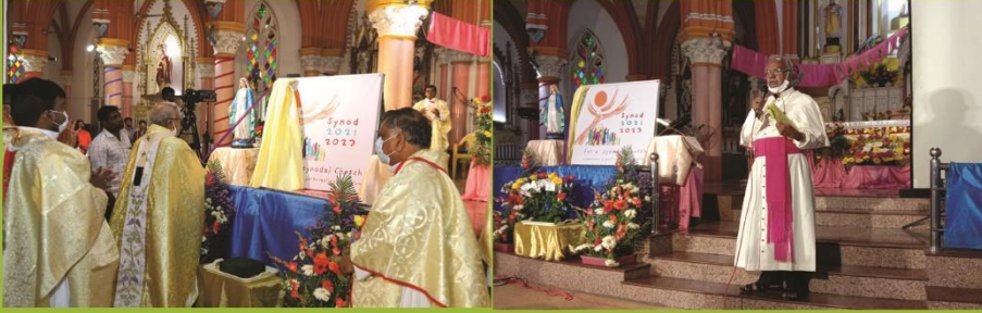
Inauguration of Archdiocesan Synod St. Mary's 26.10.2021