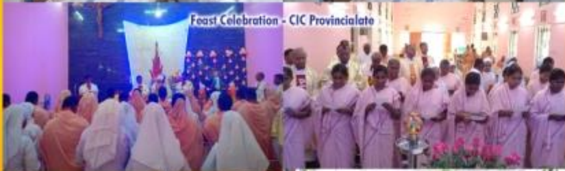
Feast Celebration - CIC Provincialate