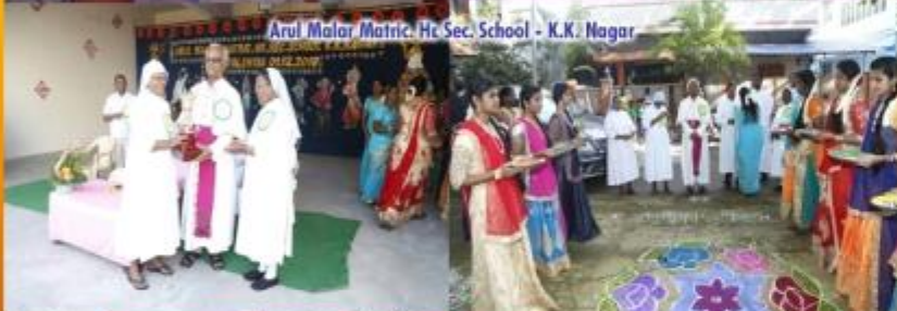
Arul Malar Matric. Hc Sec. School - K.K. Nagar