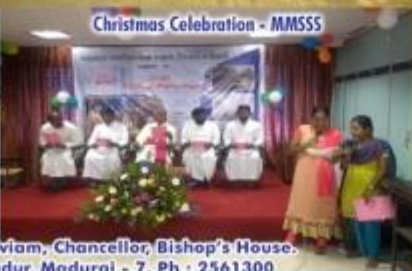
Christmas Celebration - MMSSS