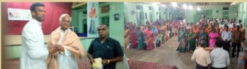
Christmas Celebration - Evangelical Commission