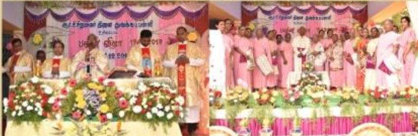
Diamond Jubilee Mass - Usilampatti