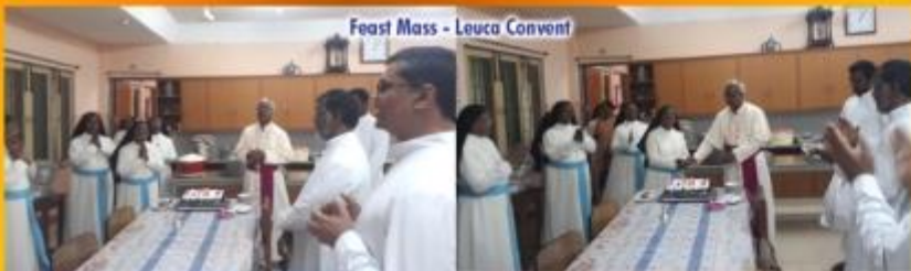
Feast Mass - Louca Convent