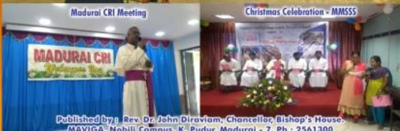
Madurai CRI Meeting