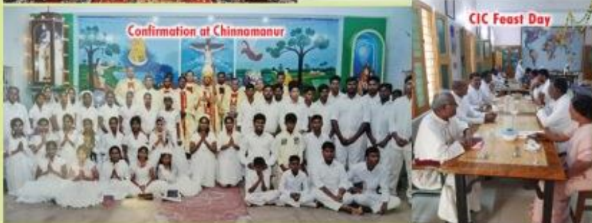
CIC Feast Day