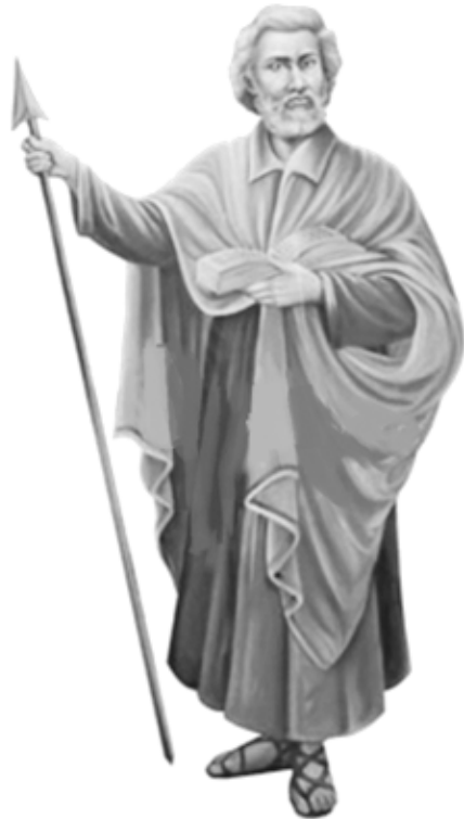
St. Thomas, the Apostle of India Pray for us

Pope's General Intention for July: That political responsibility may be lived at all levels as a high form of charity.