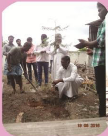
உயரிமறைமாவட கிளைஞர் நாளி சிலுவை திருப்பயணம்