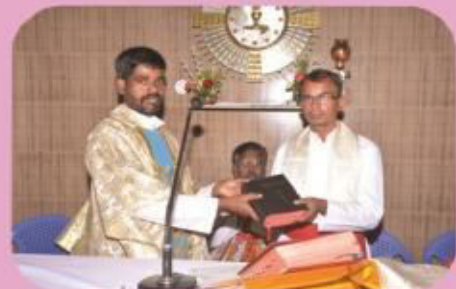
உறுதிபூசுதல் - அனுமந்திபட்டி