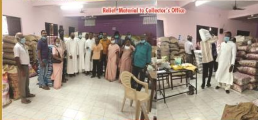
Relief Material to Collector's Office