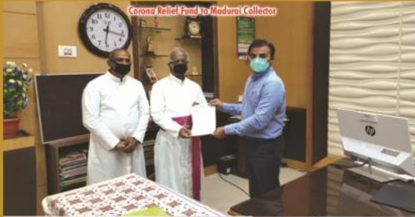
Corona Relief Fund to Madurai Collector