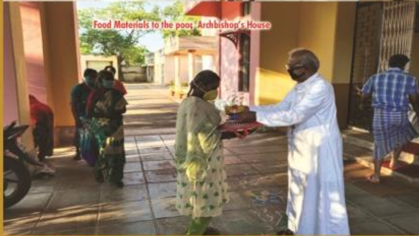
Food Materials to the poor, Archbishop's House