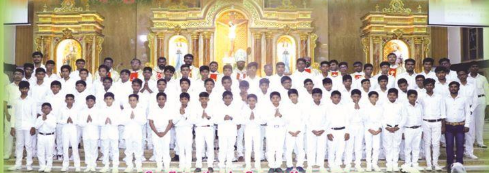
Confirmation in Gnanaolivupuram