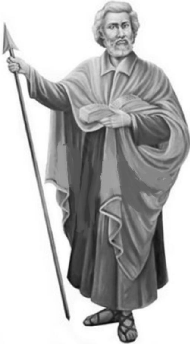
புனித தோமையாரே இந்தியாவுக்காக வேண்டிக்கொள்வோம்