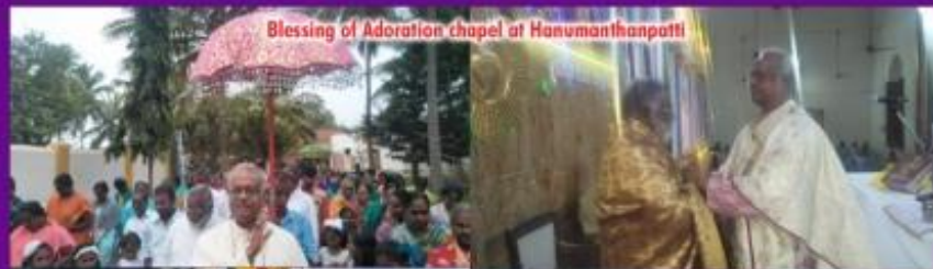
Blessing of Adoration chapel at Hanumanthapatti