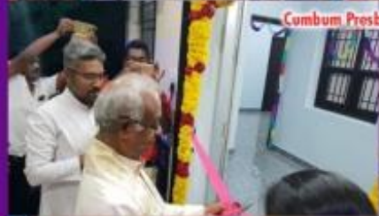
Cumbum Presbytery Blessing