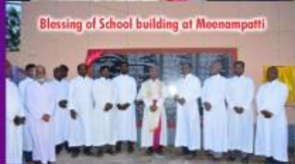
Blessing of School building at Meenampatti