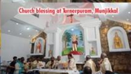
Church blessing at Turnerpurom, Munjikkal