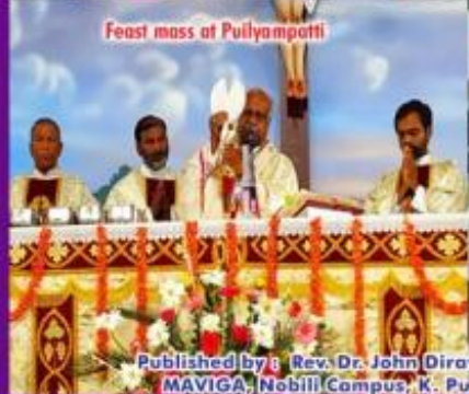
Feast mass at Pullyampatti