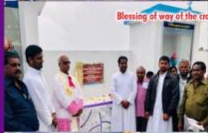
Blessing of way of the cross stations at Perumpallam