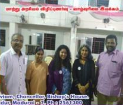
மாற்று குரவியல் விழிப்புணர்வு - வாழ்வுரிமை சிபக்கம்