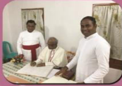
மூஞ்சிக்கல் - பங்கு விசாரணை