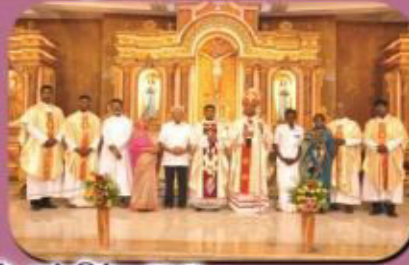
குருமாணவர்கள் சந்திப்பு 2016