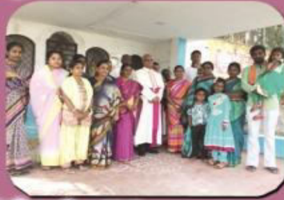
குருத்துவ அருட்பொழிவு 2016