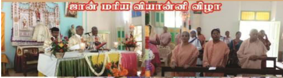
ஜான் மரிய வியான்னி விழா