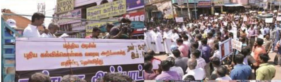
புதிய கல்விக் கொள்கை எதிர்ப்பு